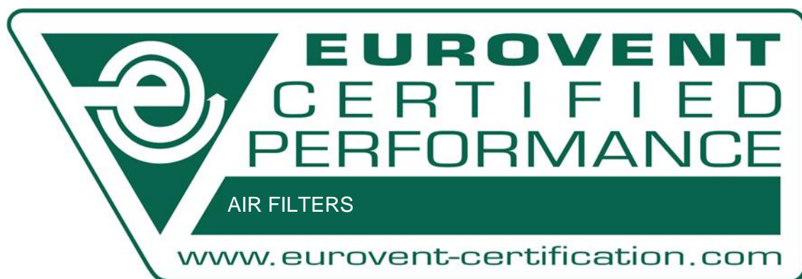
Figure 1: Illustration of the EUROVENT CERTIFIED PERFORMANCE (ECP) mark