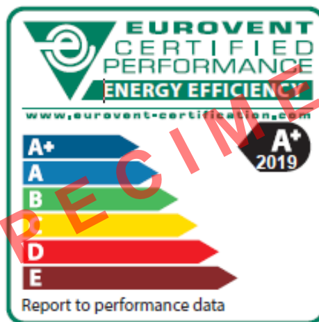
Figure 3: Illustration of the AIR FILTER Energy Efficiency Mini Labels